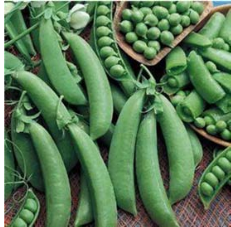
'Cascadia' Sugar Snap